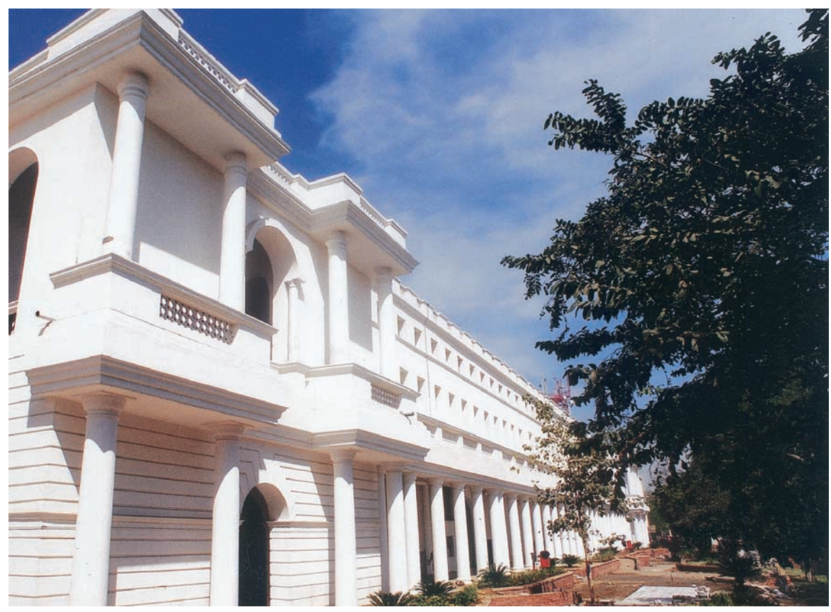
A view of Hasthakala Bhavan at Baba Kharag Singh Marg, New Delhi

development or handicrafts have been conducted;